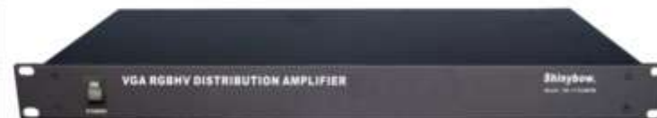
Model : SB-1116MRM