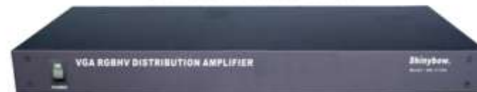
Model : SB-1116